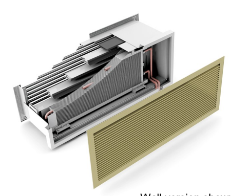
Wall version shown Note: Pipework not supplied

Internal louvre: Double skin aluminum louvre blades with ABS thermal break and blade compression seals. Actuator provided with terminal block and removable aluminum cover for ease of maintenance. Actuators can be mounted on either left or right hand side of the louvre viewed from internal side. Right hand side is standard.