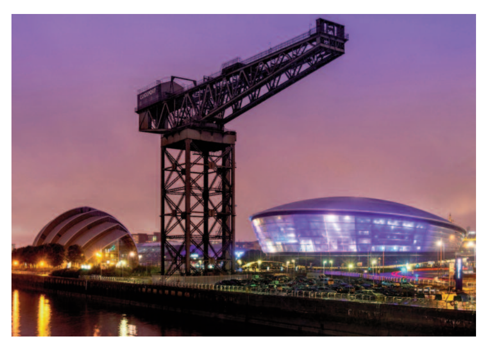
The SSE Hydro entertainment venue, Glasgow.

* www.carbontrust.com/news/2014/10/ breaking-circle-of-inertia-on-energyefficiency-commercial-buildings-sector