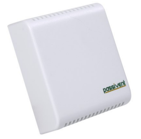
Temp only sensor

In sports halls only, to meet guidance the sensors can be mounted above 2.2m FFL.