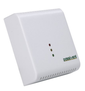
Combined Temp and CO<sub>2</sub> sensor

The CO<sub>2</sub> sensor employs Automatic Background Calibration (ABC Logic) to continuously adjust the calibration base to correct for changes in the background concentration levels and sensor drift. It continuously adjusts the sensor calibration over the life time accuracy of the product, which is expected to be 15 years.