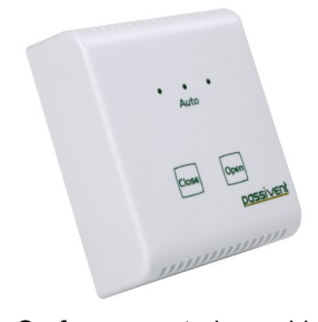
Surface mounted override

The Override function is simple to use, with occupant override touch sensitive buttons (open or close) and a preset timed return to automatic control. The return to automatic control is after a pre-determined time (between 30 minutes and 3 hours), settable on commissioning. This is usually set to 1 hour.