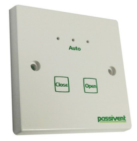
Flush mounted override

Surface or Flush mounted units. Standard Temperature or Averaging Temperature units available. Can be remotely mounted for easier access.