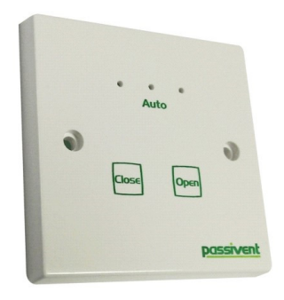
Local Room Override (Flush Mounted)