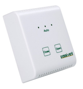
Local Room Override (Surface Mounted)