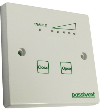
Manual Positioning Unit