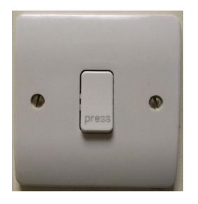
A132 boost switch