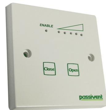
Manual Positioning Unit