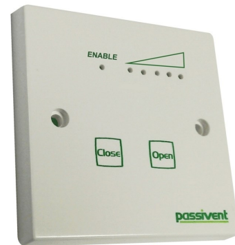
Manual Positioning Unit