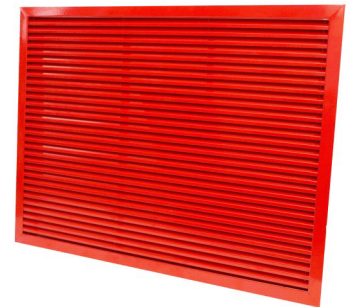
Note: 1 Way Grille shown

The 45 degree blade designs are set at 15mm pitch for high strength and low air flow resistance. Supplied with a 38mm surround flange with fixing holes as standard. Fixings by others to suit onsite requirements.